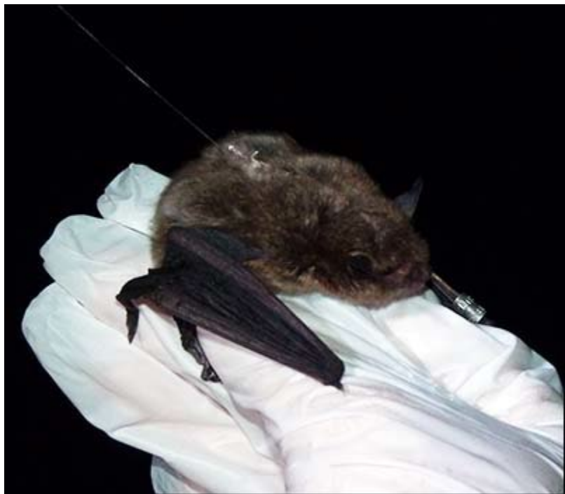
The U.S. Fish and Wildlife Service is working with the wind energy industry to minimize mortality of Indiana bats, an endangered species.

Above and beyond the services that can be assigned an economic value, bats provide cultural benefits ... well known to those who enjoy watching the silhouette of a bat against the night sky. The challenge before us is to work with the wind industry and other partners to provide for both sustainable wind energy development and sustainable bat populations.